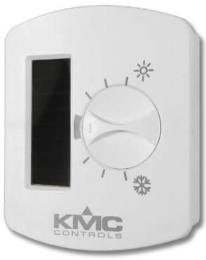
STW-6010 and THW-1102