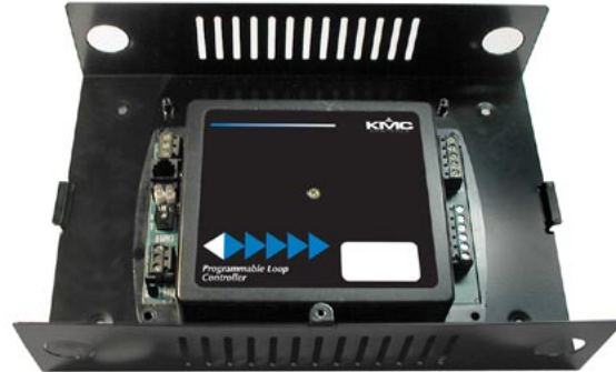
(Shown with a KMD-7401 controller mounted inside)